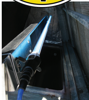
Commercial APCO system installed in rooftop package unit